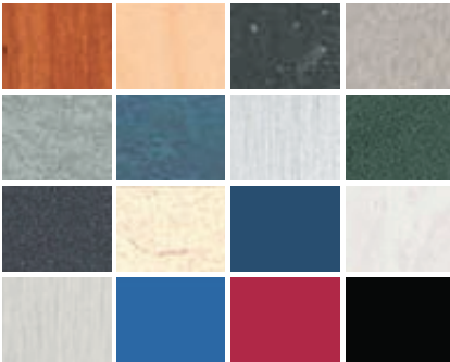
Laminates: Hundreds of textures and colors available to fit any look.