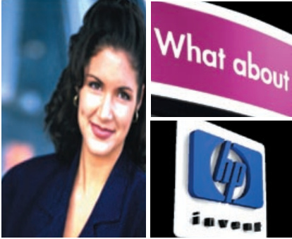
Graphics: Digital graphics of all types – murals, text signs, 3D stand-off logos.

Mosaic and Mosaic Plus offer a family of compatible panels to achieve any design objective.