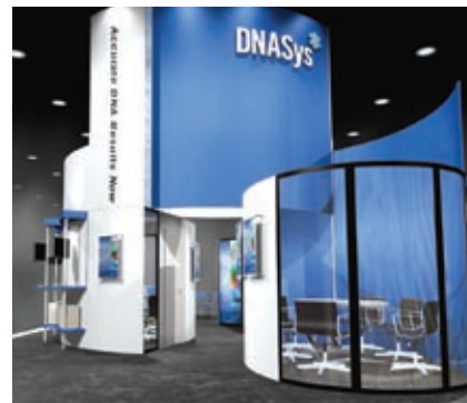
Conference rooms allow you to conduct business away from the commotion of the show floor.

Great for conference rooms. Windows create space for private meetings yet maintain an open feel.